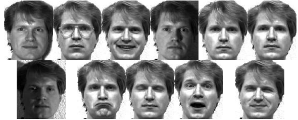
Figure 2. Yale face database

For each value of k , at least 50 runs were performed with different random partitions between the training and test sets, and the average results are displayed. We choose 14 (i.e., the number of classes-1) as the final dimension of the PCA- and LDA-based methods according to [9]. The results are shown in Table 1.