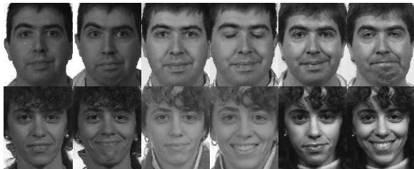
Figure 4. FERET face database